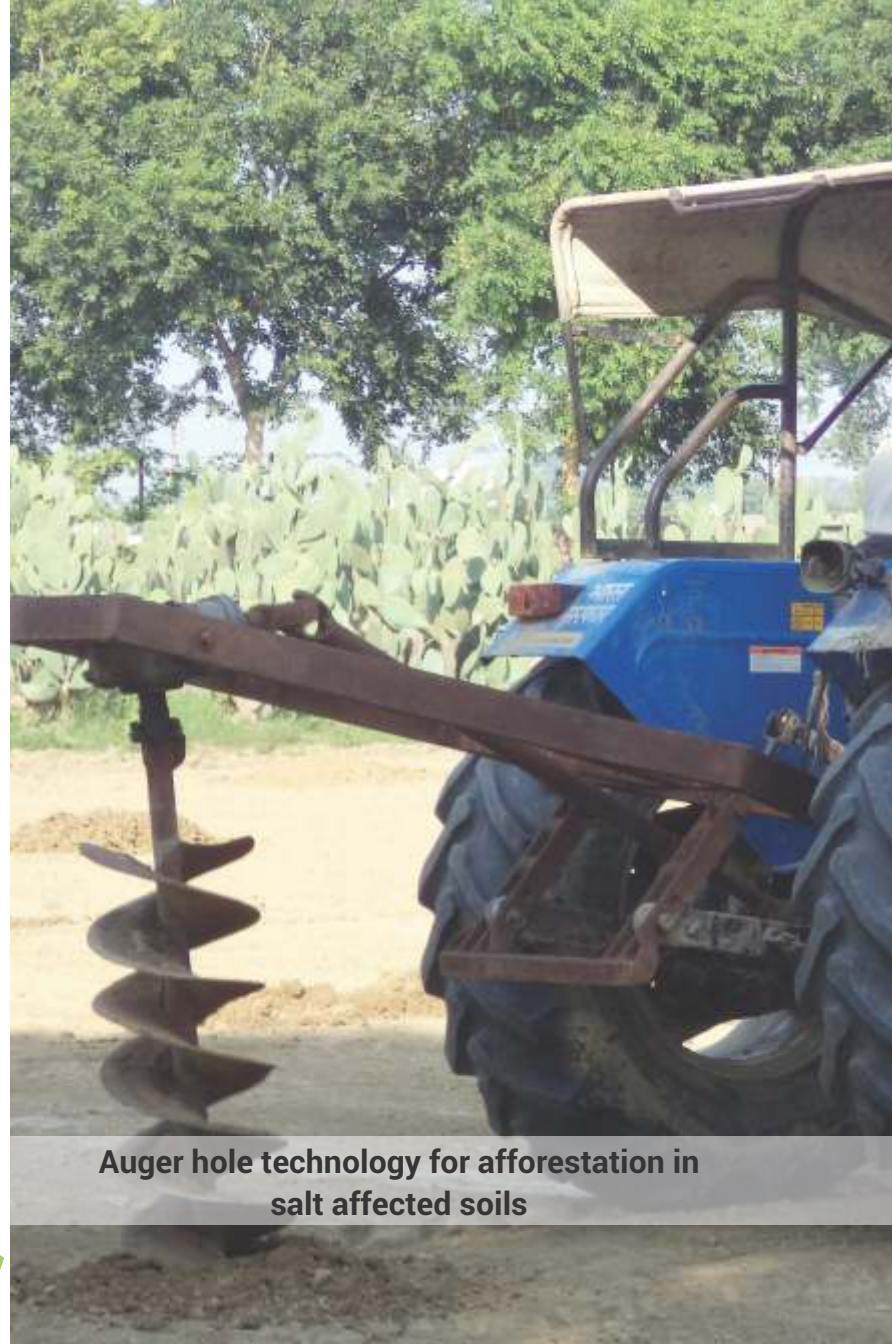
Auger hole technology for afforestation in salt affected soils

8.2-9.0 Grevillia robusta, Azadirachta indica, Melia azedarach, Leucaena leucocephala, Hardwickea binnata, Moringa oleifera, Populus deltoids, Tectona grandis, Grewia asiatica, Aegle marmelos, Prunus persica, Pyrus communis, Manifera indica, Morus alba, Ficus spp., Sapindus laurifolium, Vitis vinifera