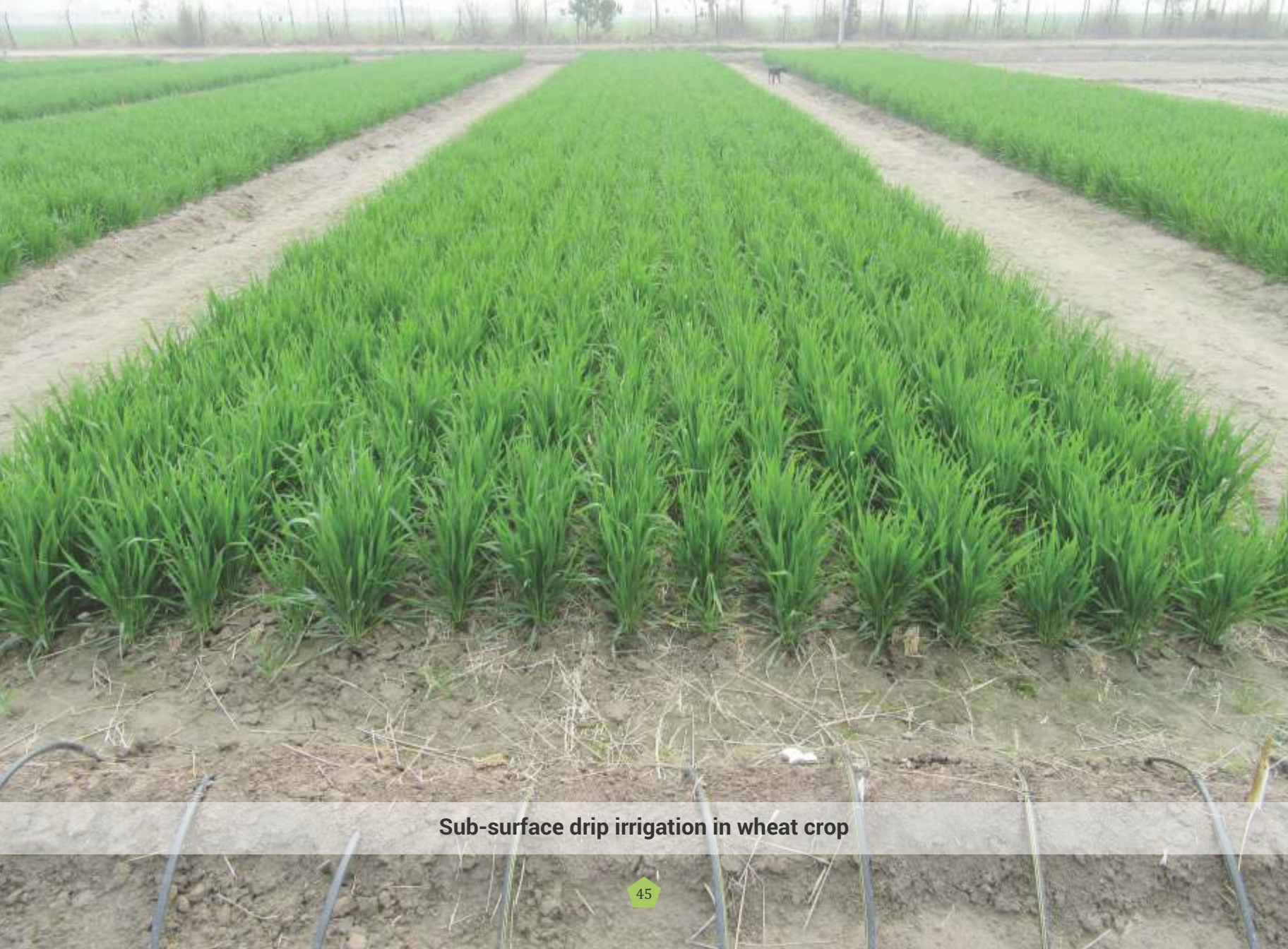
Sub-surface drip irrigation in wheat crop