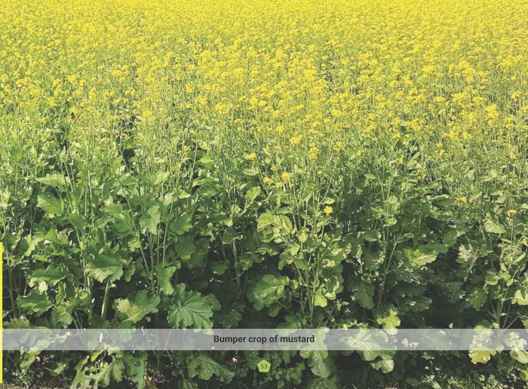
Bumper crop of mustard