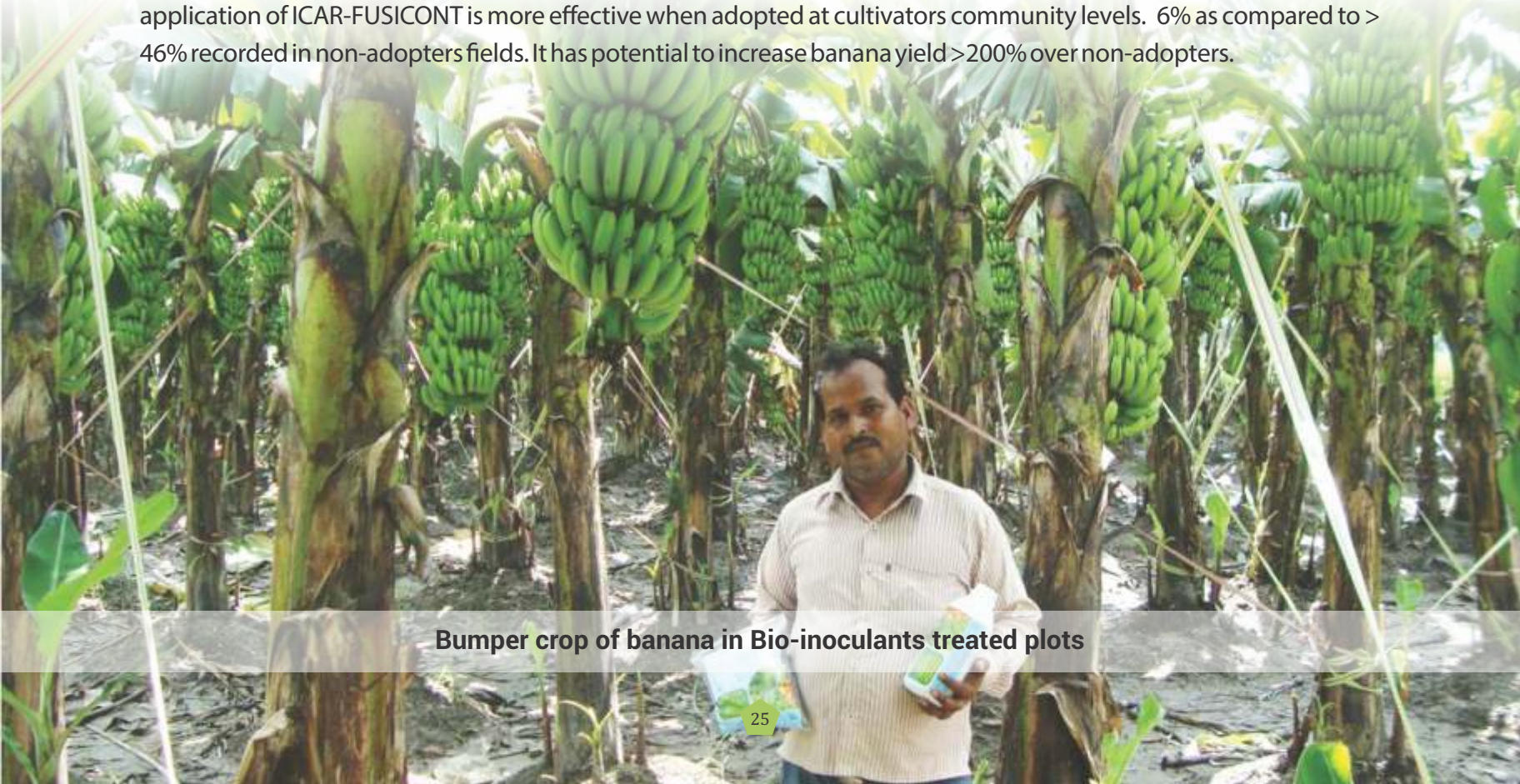
Bumper crop of banana in Bio-inoculants treated plots

ICAR-FUSICONT: This bio formulation is effective in controlling the Fusarium oxysporum f.sp. cubense Tropical race 4 (Foc TR-4) in Grand Naine variety of banana in Uttar Pradesh and Bihar. The use protocol comprises drenching of secondary hardened tissue culture plantlets in nursery with 1% solution of ICAR-FUSICONT before planting in main field, followed by soil drenching with 2% mixture of ICAR-FUSICONT at the critical stages of the crop growth. The application of ICAR-FUSICONT is more effective when adopted at cultivators community levels. 6% as compared to > 46% recorded in non-adopters fields. It has potential to increase banana yield >200% over non-adopters.