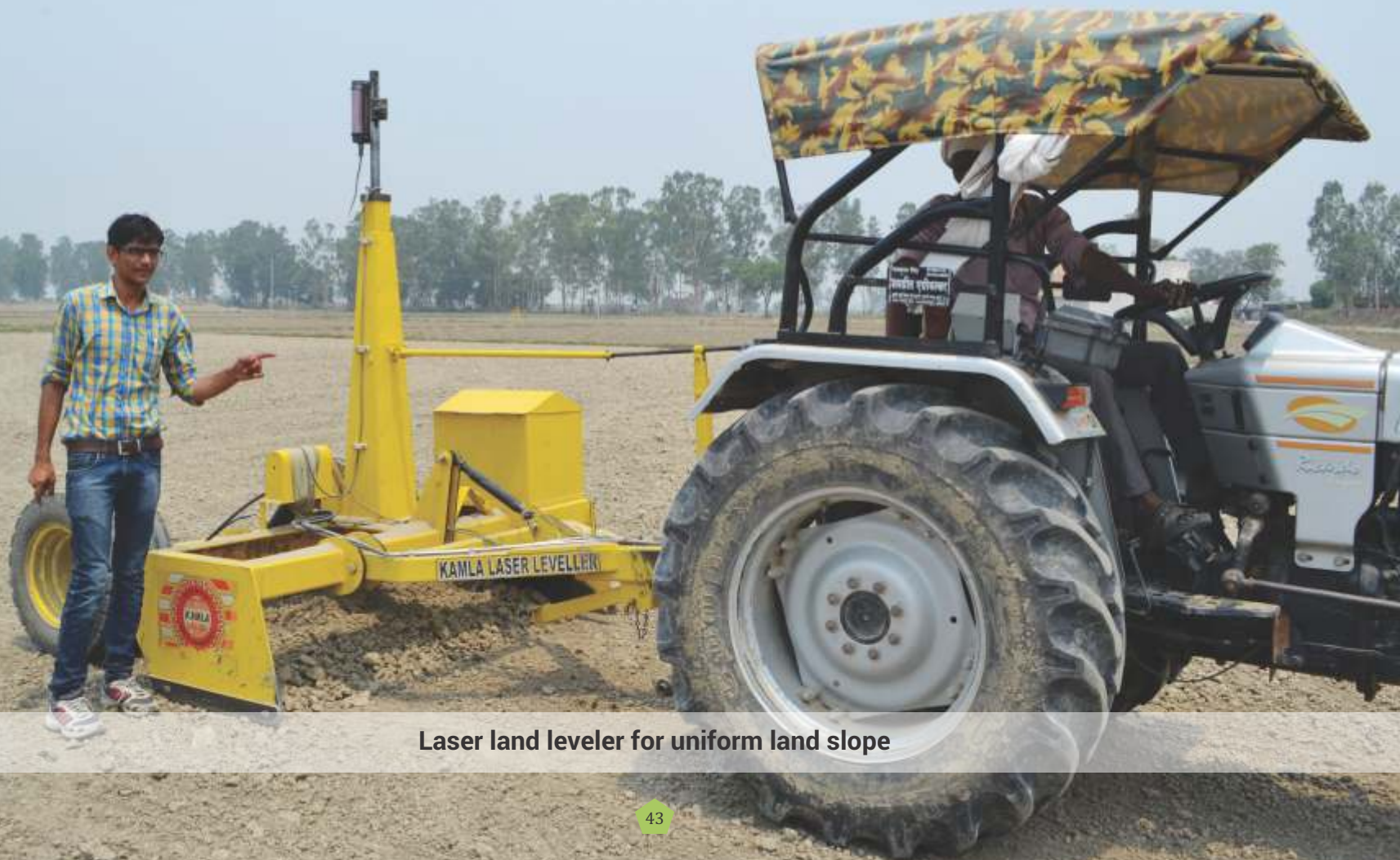
Laser land leveler for uniform land slope