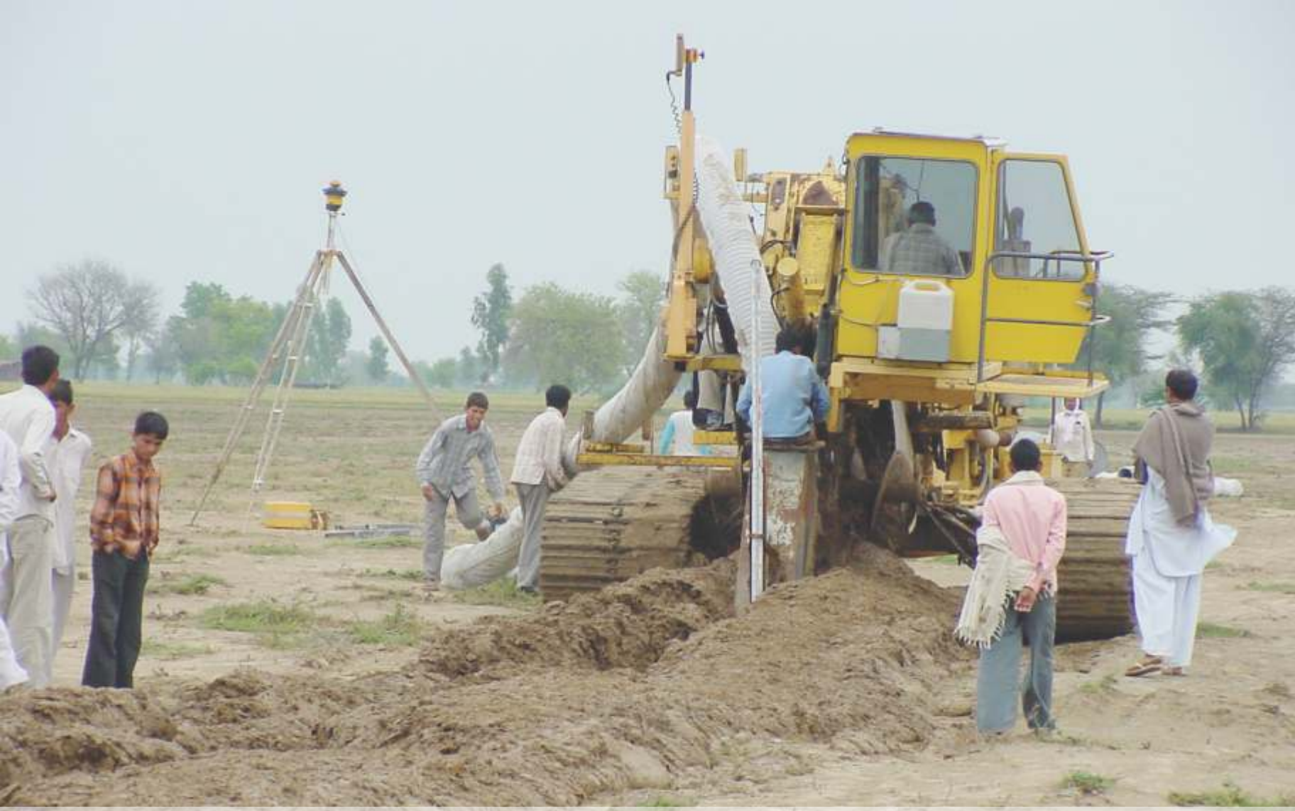
Installation of sub-surface drainage in waterlogged saline areas