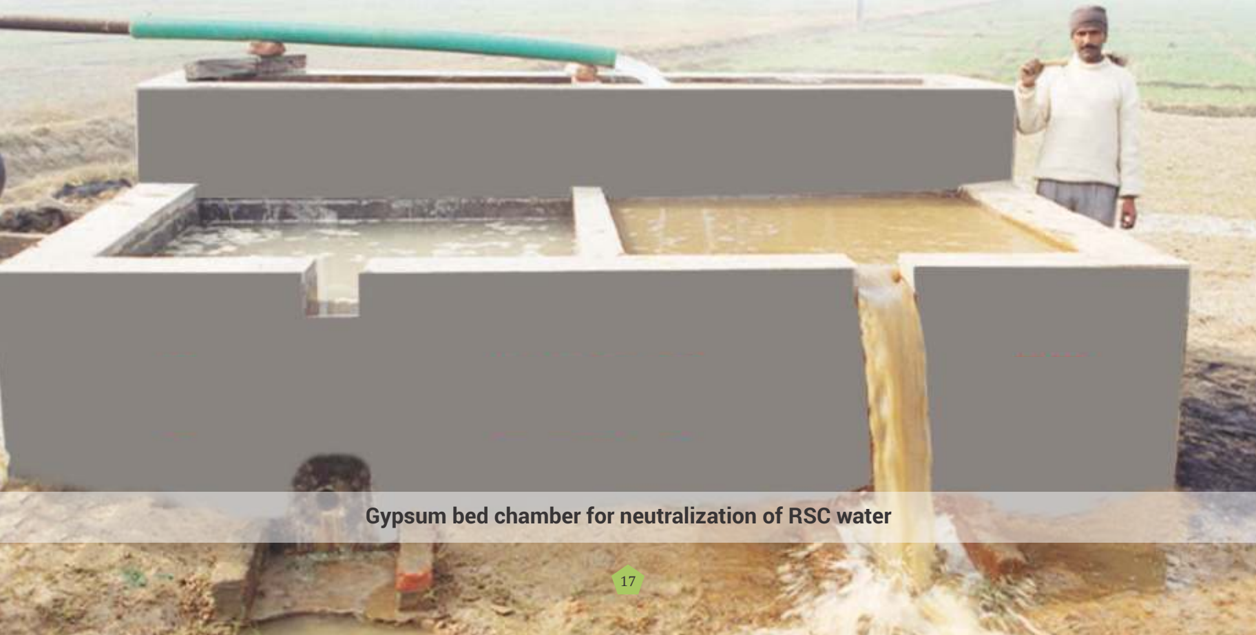
Gypsum bed chamber for neutralization of RSC water

Application of farm yard manure (FYM) ( 10 \text{ t ha}^{-1} ), gypsum ( 5 \text{ t ha}^{-1} ) and press mud ( 10 \text{ t ha}^{-1} ) in combination with NPK are more beneficial and sustainable than NPK alone when irrigated with sodic water. Under alkali water irrigation, use of N: P: K @ 120:25:40 \text{ kg ha}^{-1} + gypsum ( 5 \text{ t ha}^{-1} ) + press mud ( 10 \text{ t ha}^{-1} ) helps to achieve \sim 5.0 and 4.5 \text{ t ha}^{-1} of rice and wheat grain yield, respectively.