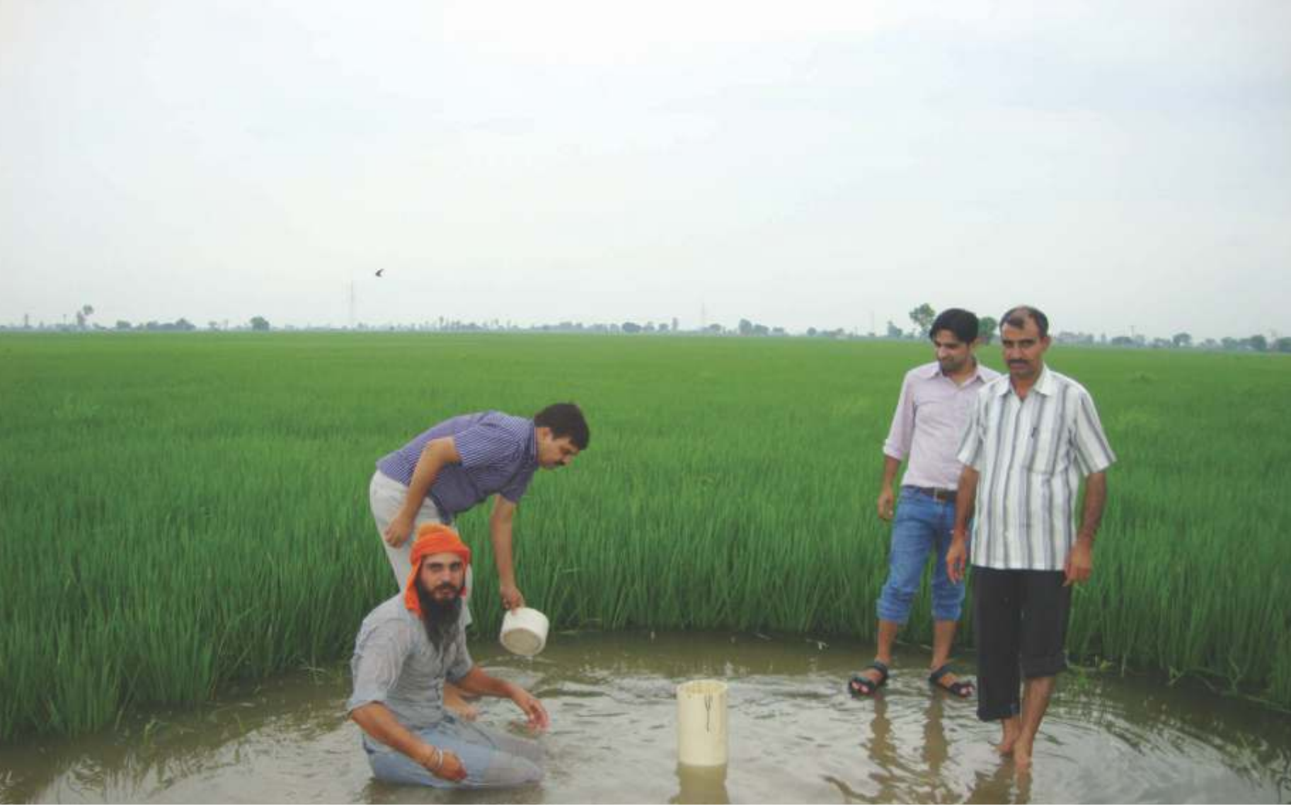
Artificial ground water recharge structure in rice crop