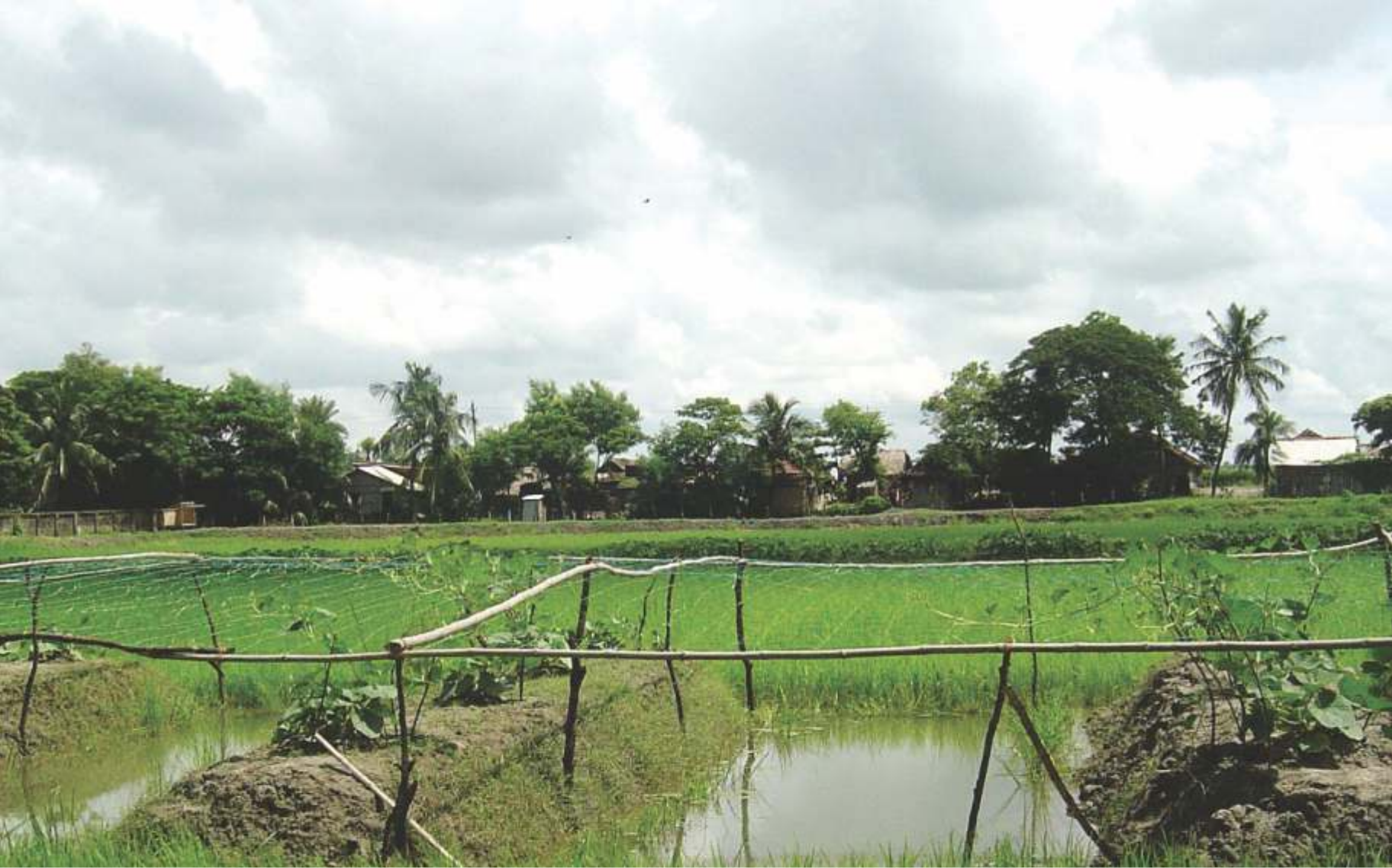
Paddy cum fish cultivation