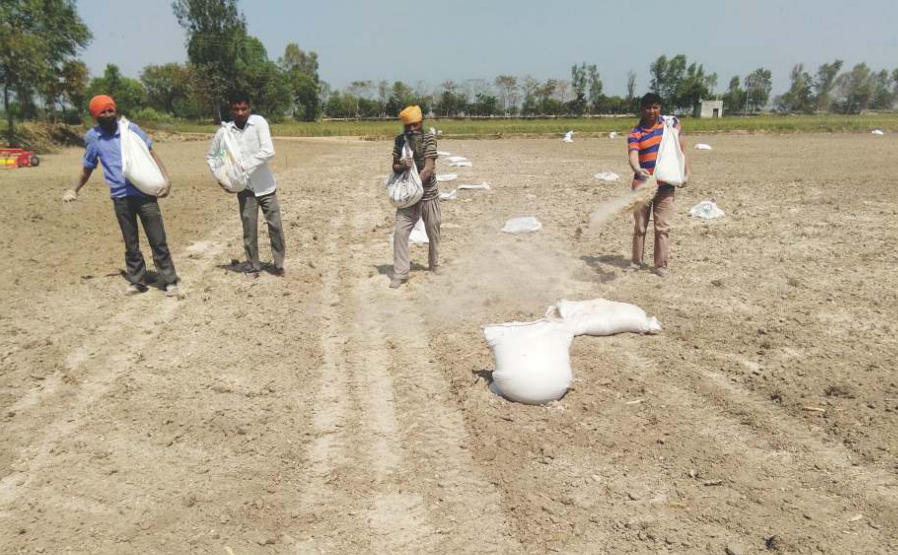
Broadcasting of gypsum for sodic soil reclamation