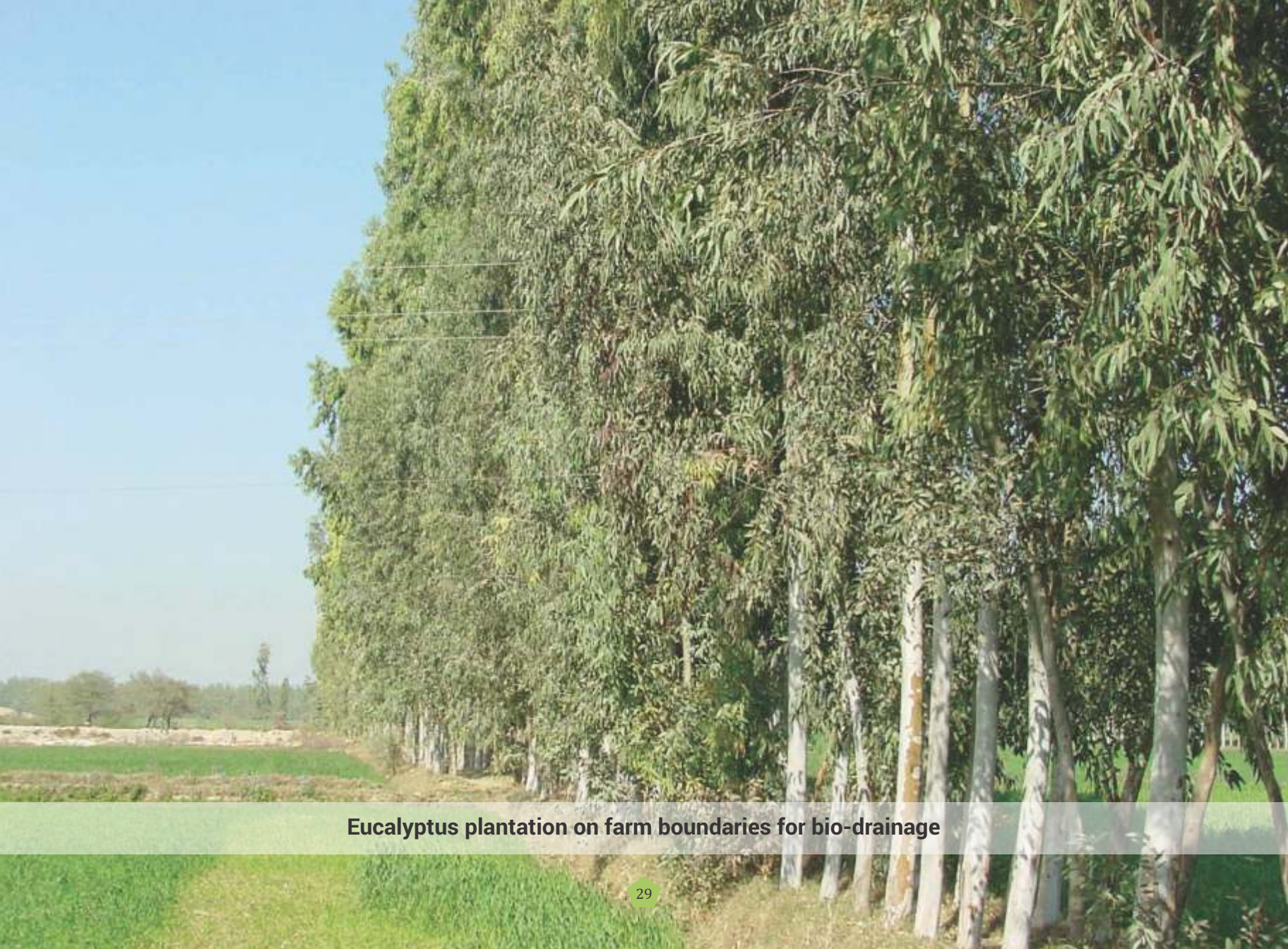
Eucalyptus plantation on farm boundaries for bio-drainage