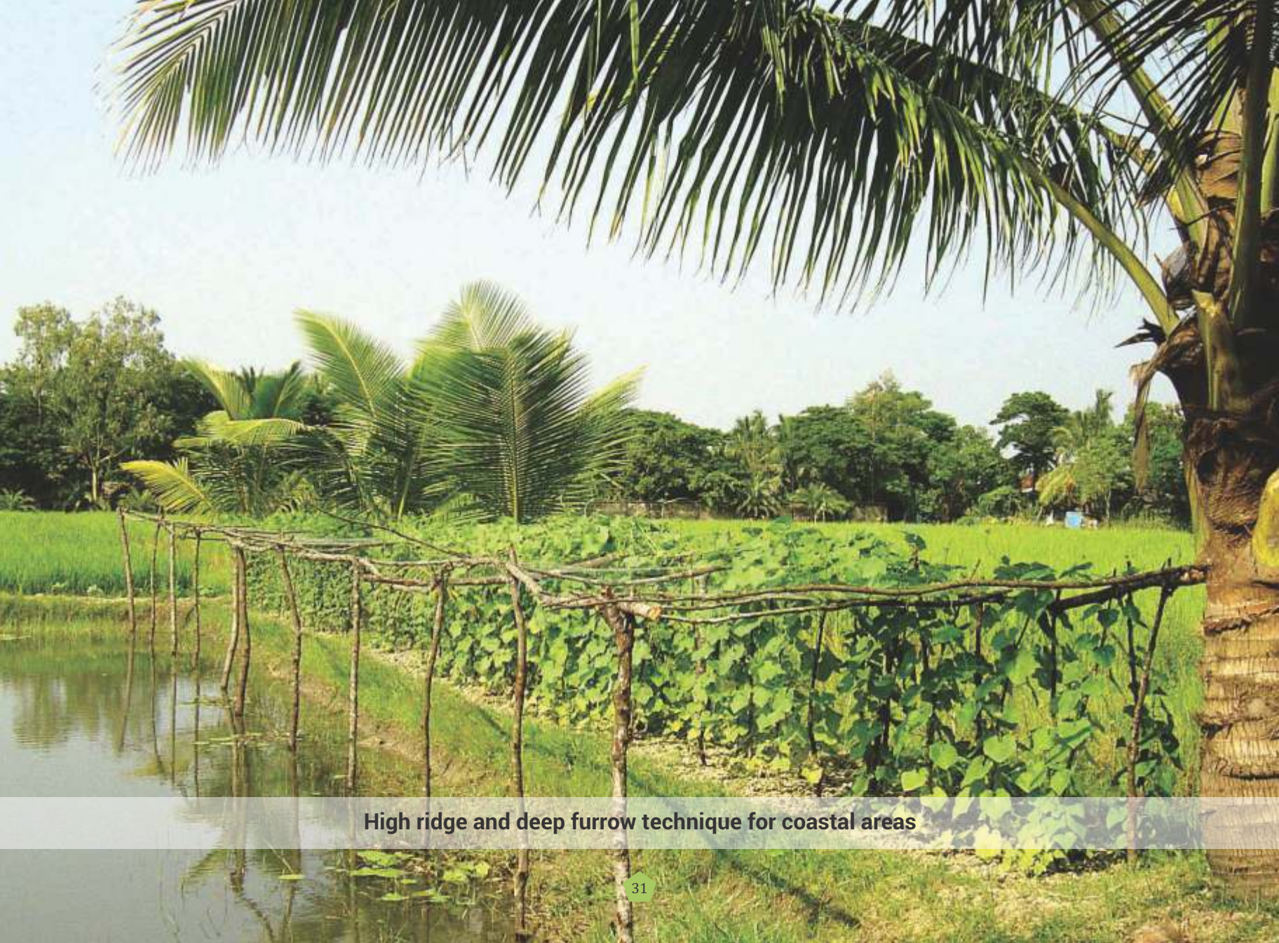
High ridge and deep furrow technique for coastal areas