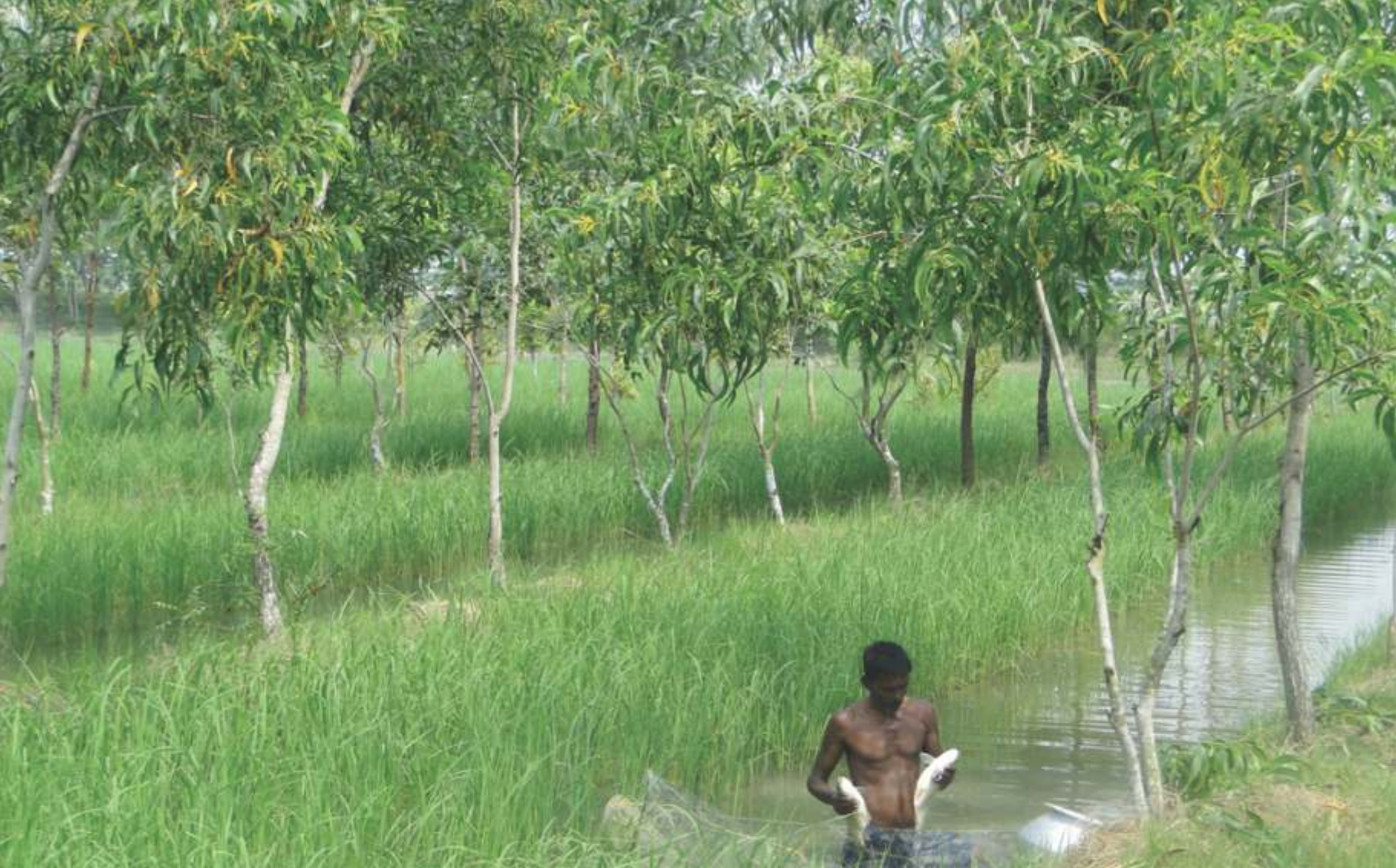
Raised and sunken beds for integrated farming