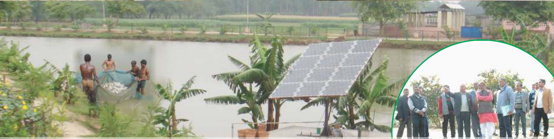
Multi-enterprise model for farmers' livelihood security