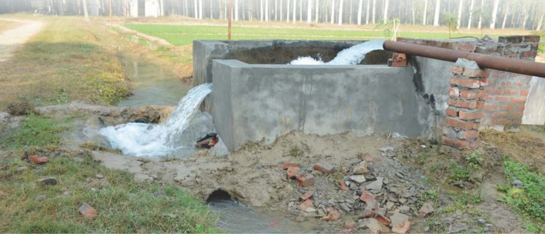
Blending of good quality water with poor quality water

Productivity and profitability: Generally the crop yields are 10-15% higher in cycling use of water compared to the mix use. Dilution of saline groundwater through rainwater recharge and subsequent use for life saving irrigation in mustard and wheat crops enhances crop yield by 5 to 20% respectively.