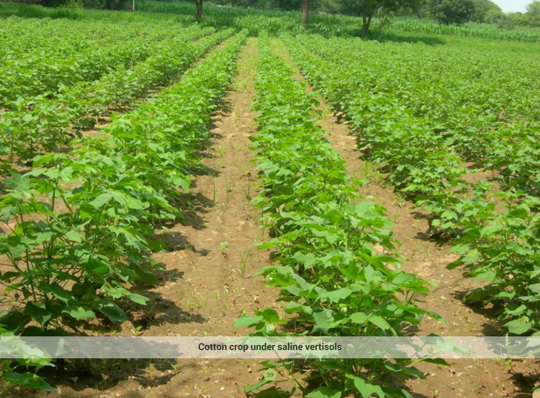
Cotton crop under saline vertisols