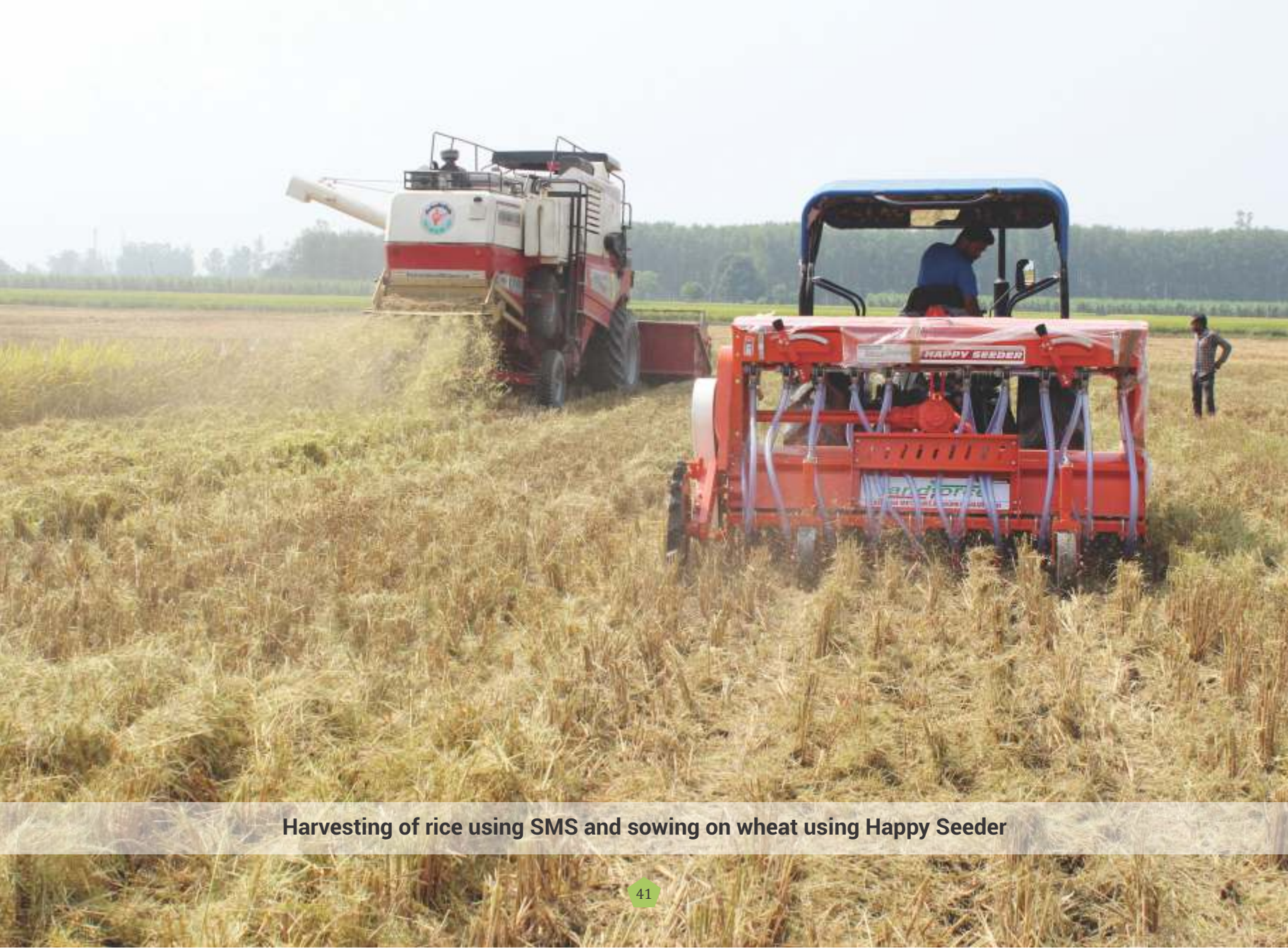
Harvesting of rice using SMS and sowing on wheat using Happy Seeder